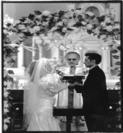
Most observers agree that the social institution of marriage is substantially weaker than it was a half-century ago.